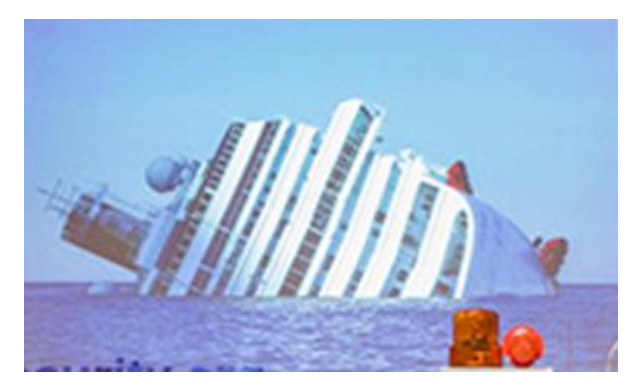
Figure 5: Possible collision after a fake CPA alert.

Possible cyber-attacks to AIS are the modification of all ship data regarding position, course, cargo, speed, ship's name, creation of "ghost" vessels at any arbitrary location in the ocean, which would be recognized by AIS receivers as genuine vessels, triggering a false collision warning alert, resulting in a coarse adjustment.<sup>2</sup> In Fig. 5 a possible collision after a fake Closest Point of Approach (CPA) is illustrated.