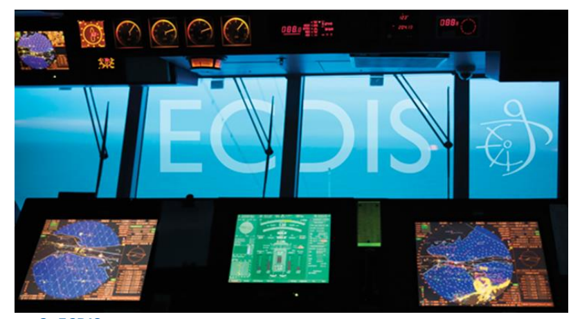
Figure 3: ECDIS.

the course due to a non-existent storm, impersonate as marine authorities to trick the vessel crew into disabling their AIS transmitter, rendering them invisible to anyone but the attackers themselves, enforce vessels to increase the frequency with which they transmit AIS data, resulting in all vessels and marine authorities to be flooded by data, carrying out, in essence, a denial-of-service attack, fake "closest point of approach" alert can trigger a collision warning alert.<sup>22</sup>