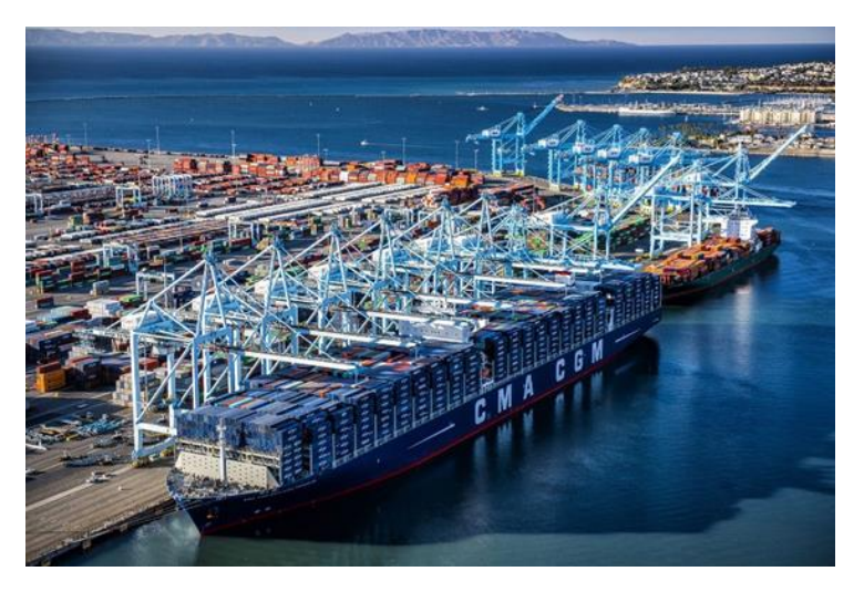
Figure 2: Los Angeles port.<sup>20</sup>

by local Internet network technologies, satellite communication, and navigation systems making the bridge system vulnerable to cyberattacks.<sup>13</sup>