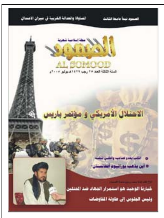
Figure 3: Al-Somood Magazine.

the property of Saudi Al Oaeda, and called on imitators to develop and franchise their own brand names 46