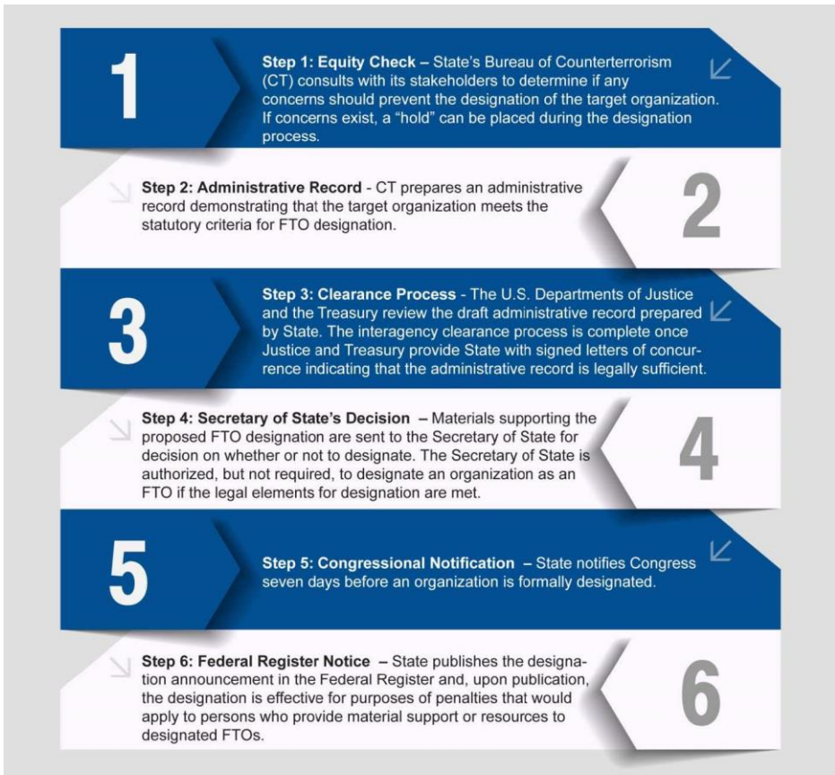
Figure 2: State’s Six-Step Process for Designating Foreign Terrorist Organizations (FTO).